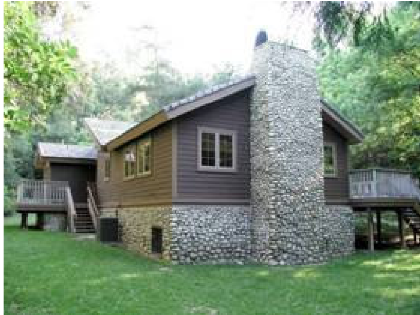
Monrovia Canyon Park Conference Center The Site for New Hope's Reclamation Retreat

Newsletter for New Hope Christian Fellowship